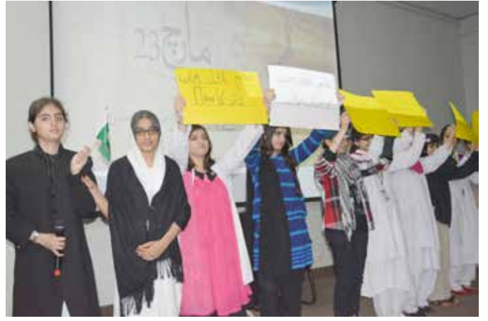
Students performing a skit on Pakistan Resolution Day celebrations