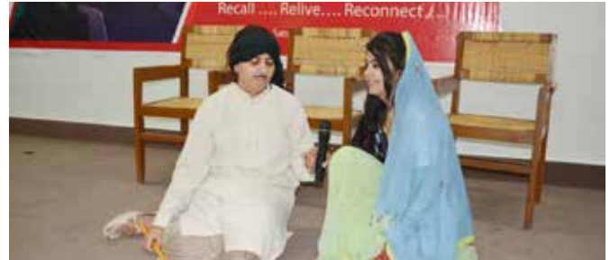
Students performing skit

A series of colorful programs and performances were given by MBBS and BDS students. The Alumnae shared their experiences and expressed their heartfelt gratitude to the Association for providing this grand platform and a great opportunity to interact with Alumnae, faculty and present students.