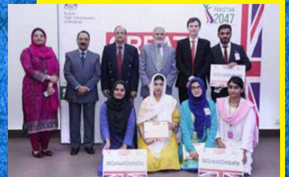
Great Debate by British High Commission