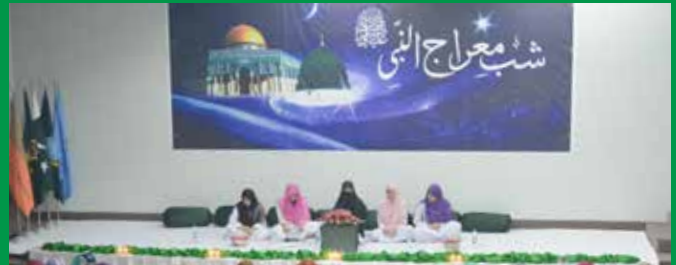
Faculty members and students in program to commemorate the Shab e Meraj un Nabi (SAW)