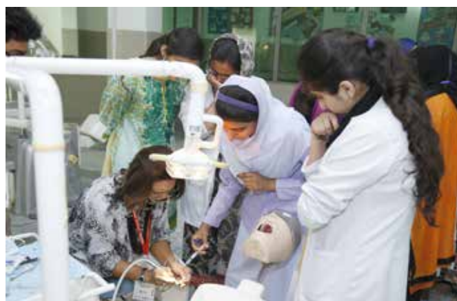
Dental Workshop in progress

cannot make progress and to realize this dream the women must be equipped with higher professional education. "It is satisfactory that more and more women are getting higher education, in medical colleges 70 % students are females, but unfortunately majority of these qualified