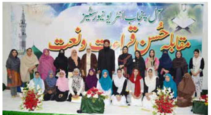
Participants of All Punjab Intersarsity Qiraat and Naat competitions with judges and faculty members.

The winners were awarded cash prizes and certificates.