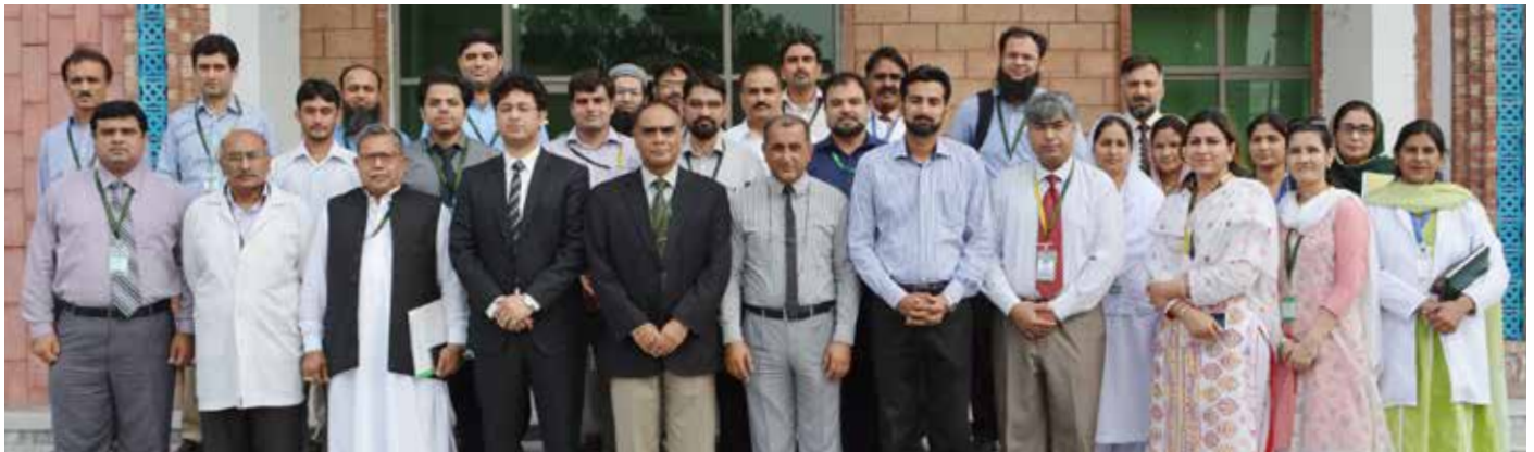
Group Photo of Senior administration and staff of MTH with external auditors' team