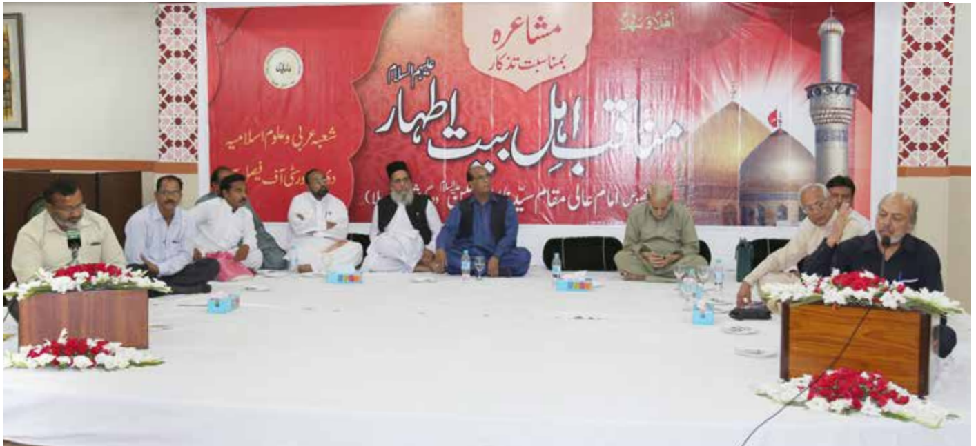
Poets paying tribute to Ehl-e-Baet Itehar during Mushaera for males

The event culminated with Druod o Salam and Dua.