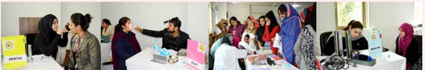
Medical checkup of fresh entrants