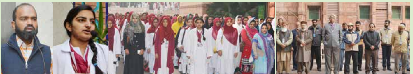
TUFIAN paying tribute to Quaid-e-Azam Muhammad Ali Jinnah (Rehmat-U-Allah Alaih)

They said that our young generation should follow Quaid's guiding principle "Unity, Faith and Discipline". They also discussed Quaid's vision for Pakistan as a democratic welfare state where people could live with love, fraternity and harmony. The program concluded with special prayer for the stability and prosperity of Pakistan.