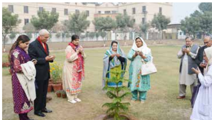
Members of Nursing Council Team offering prayer after planting a sapling in MTH lawn