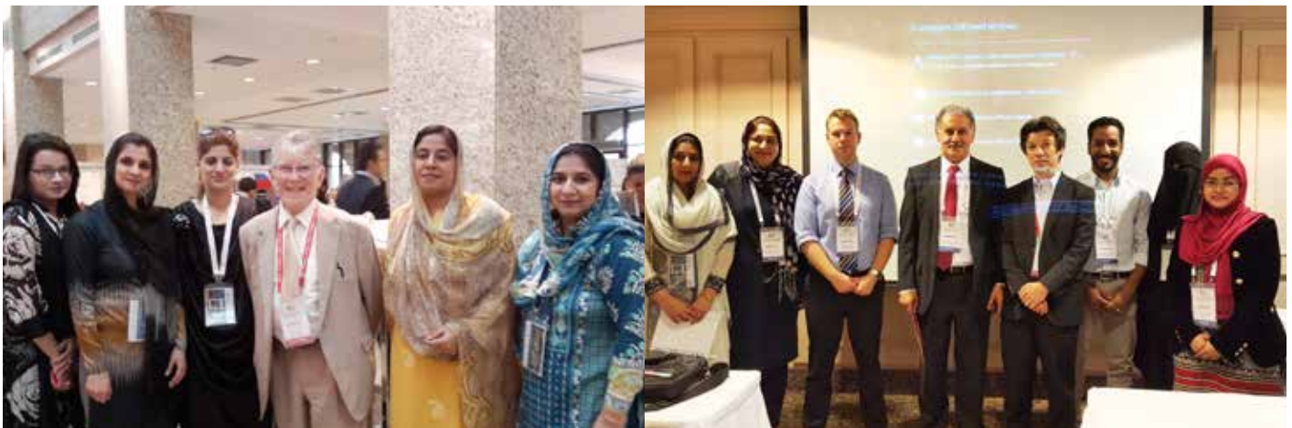
Team from UMDc in International Conference on Medical Education (ICME) 2015 -Turkey

The faculty also visited the transcontinental region famous for its mosques and rich cultural heritage. It was a wonderful learning experience and a delightfully proud moment for all.