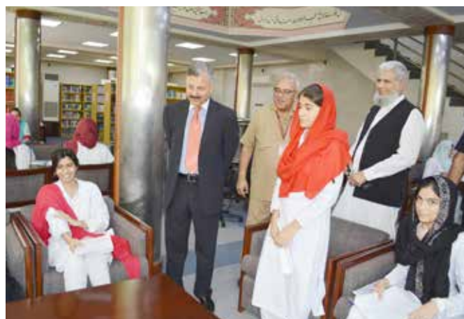
Sharing views with TUF IANS in the Library