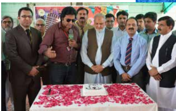
First Anniversary of FM 96.6