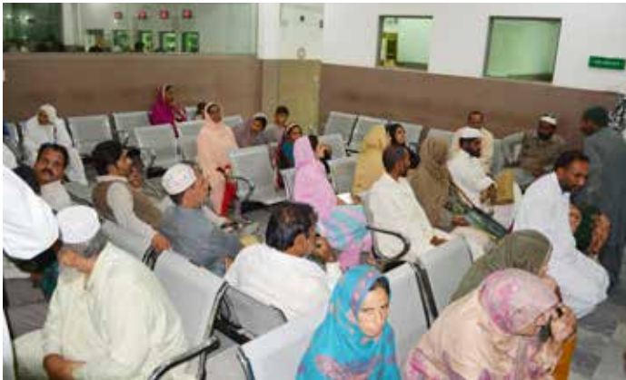
Free Diabetes Camp at Madinah Teaching Hospital on "World Diabetes Day"