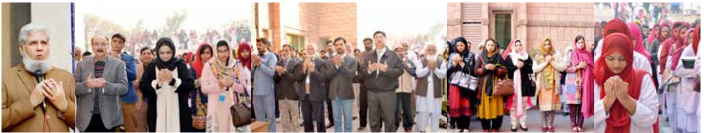
Faculty members, students and staff offering Fateha for the for the martyrs of APS