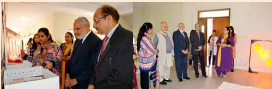
Faculty members visit stalls