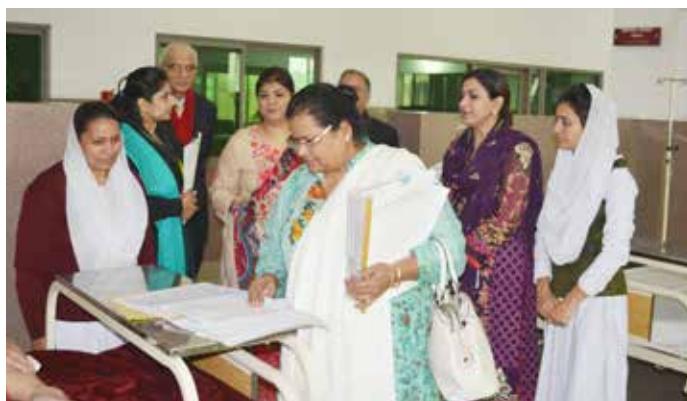
Nursing Council Team visiting a Ward of MTH

The team visited different departments of MTH i.e. OPD's, ICU, Medical ward, Surgery ward, Paediatric ward, neonatal unit, General OT, Gynae OT, Labour Room, Emergency and Medical Lab etc. The team was impressed and appreciated hospital working."