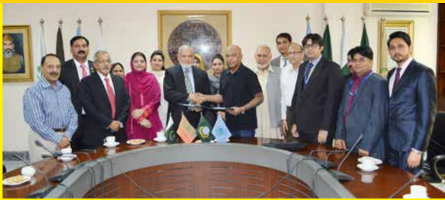
TUF Inks MoU with Kotler Impact