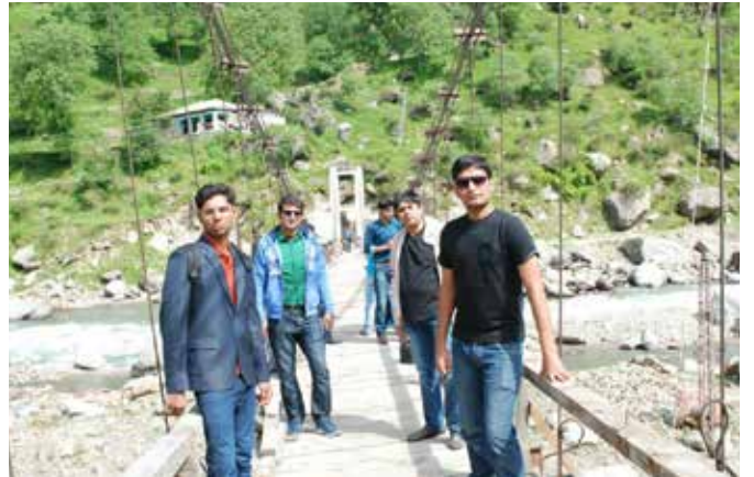
Faculty members and students of Management Studies during their excursion tour of Naran