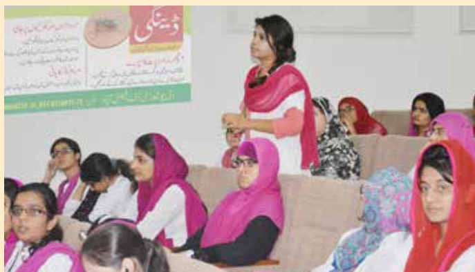
Questions Answer session