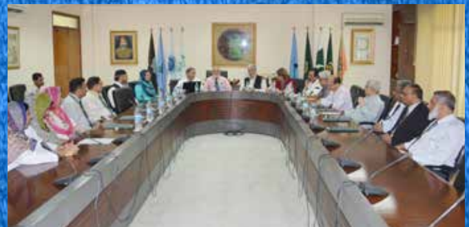
Members of CPSP team during the meeting with faculty members of University Medical & Dental College