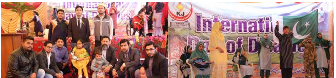
Faculty and Students of Rehabilitation Sciences observing Day of Person with Disability

and the problems they face in their everyday lives. TUF Rehabilitation Society in collaboration with Special Education Centers, Faisalabad also observed this day. The promotion was made through dramas, songs and performances by children with disabilities. Officials from special education departments, political figures and prominent personalities attended the event to uplift the spirits of the participants. Prizes were also awarded by TUF Rehabilitation Society.