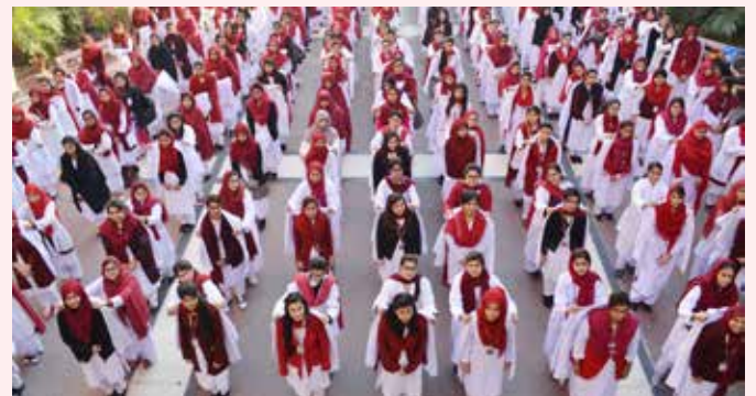
White Coat Ceremony

To make the first evening memorable for the new comers, Cultural Society TUF arranged an exclusive musical evening. Renowned folk singers mesmerized the audience with their fascinating performance.