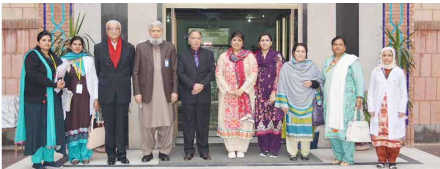
PNC team with senior Management of UMDC and MTH