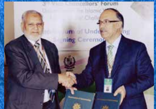
MoU with INONU University Turkey