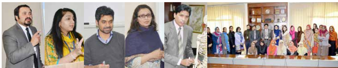
Guest Speakers giving talk on the topics