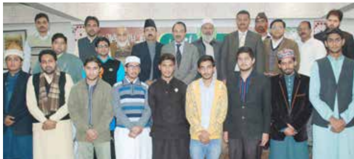
Group of participants of competition