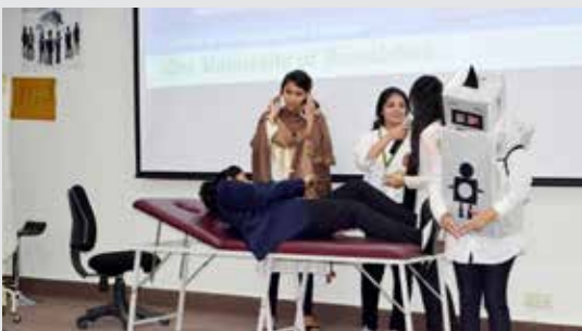
Students presenting a skit

He suggested that to increase the Computer literacy across the country, Information Technology trainings must be essential part of our curricula at school level particularly in the rural areas. Only with this mind-set can we cope with other nations in this competitive global village.