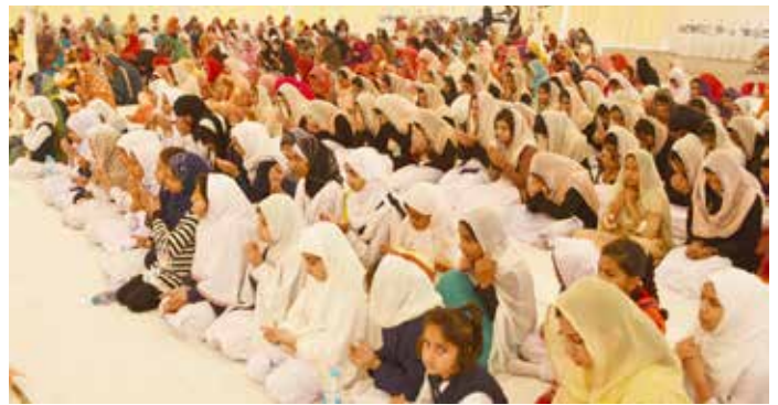
Students, faculty members and other participants in Mehfil-e-Milad (Sallallahu Alaihi Wa Sallam)