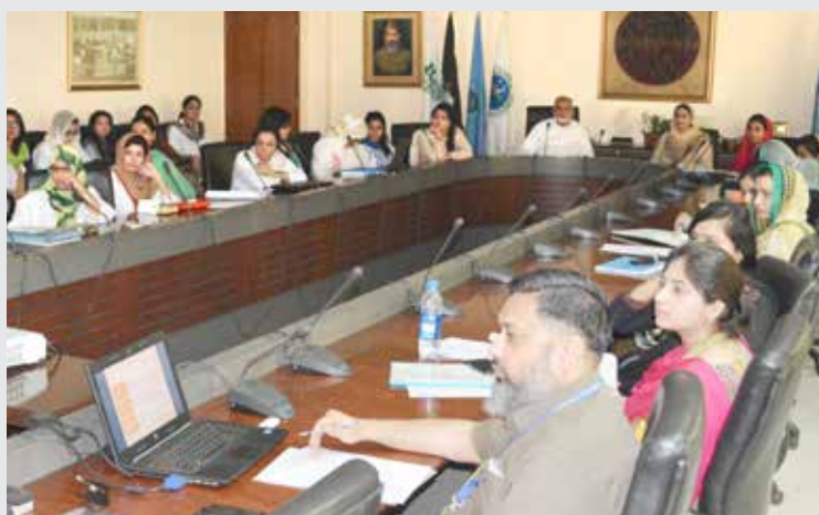
Research Thesis Viva session in progress