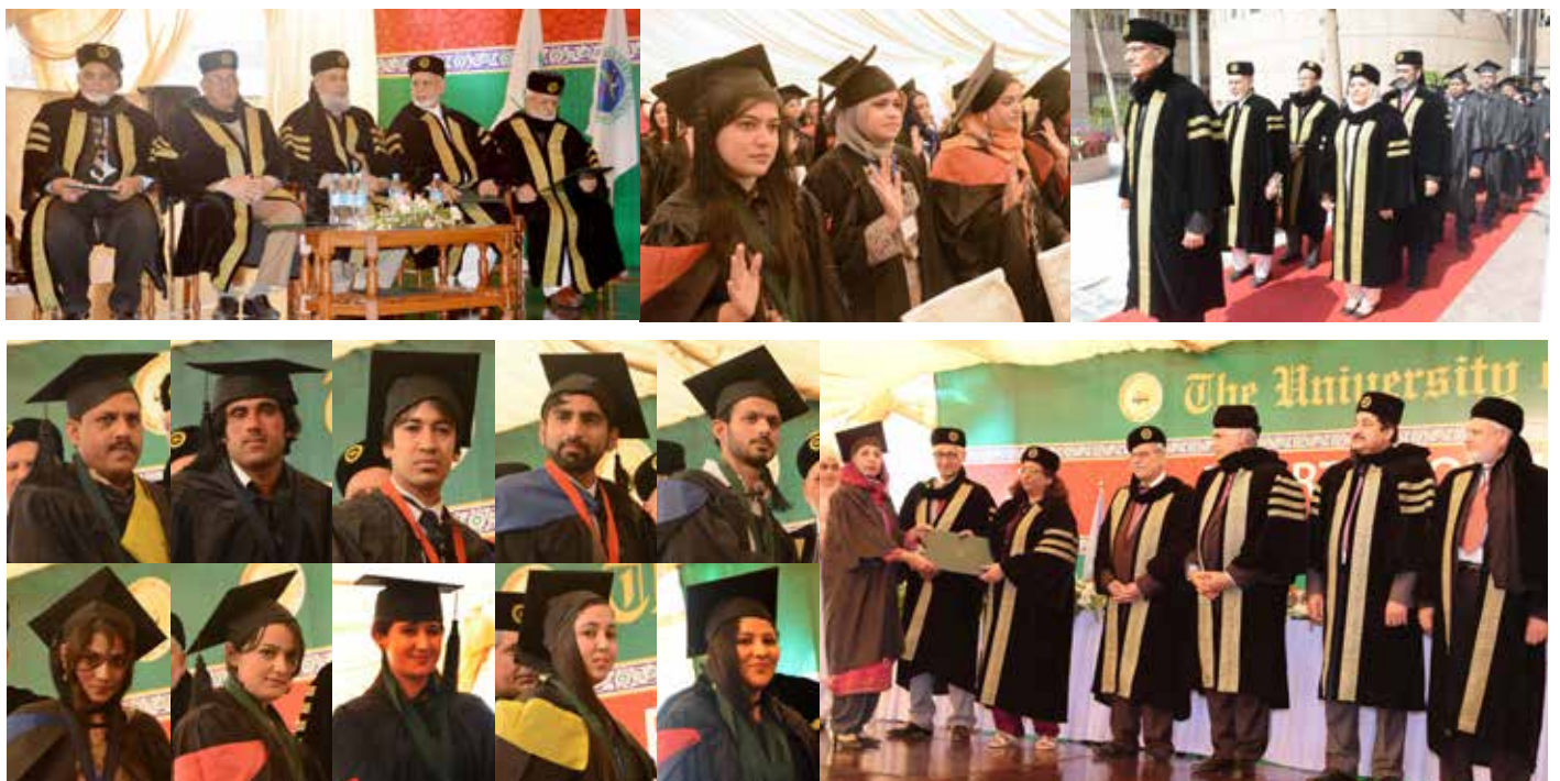
Graduates being awarded medals and degrees