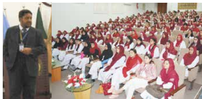
Participants in the orientation session of TUF Libraries

The University of Faisalabad (TUF) Libraries organized a presentation on "TUF Libraries: Resources and Services" for the new medical students on December 14, 2015. More than 100 new students learnt about the value of library in learning, research and the sharing of knowledge. They found the video Libraries in the Internet Age interesting. This orientation helped the new students to differentiate between using a library and the Google for quality information and research.