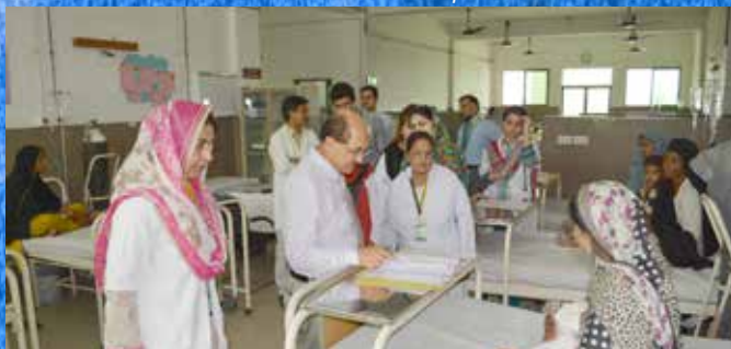
Members of CPSP team during the visit of Madinah Teaching Hospital