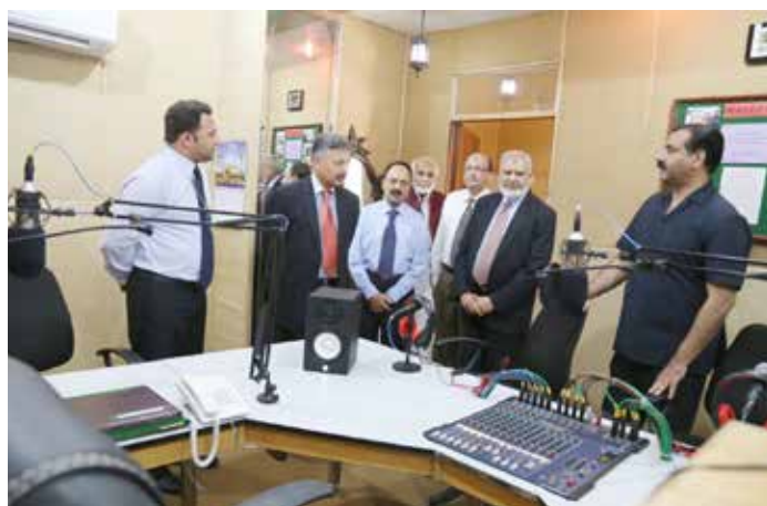
Visits Radio TUF IANS FM 96.6