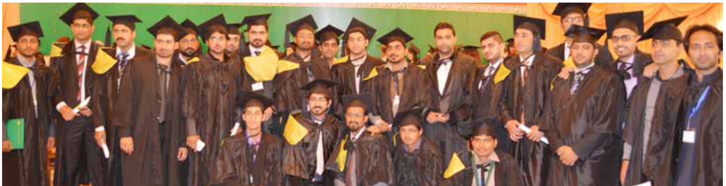
Group photo of Graduates