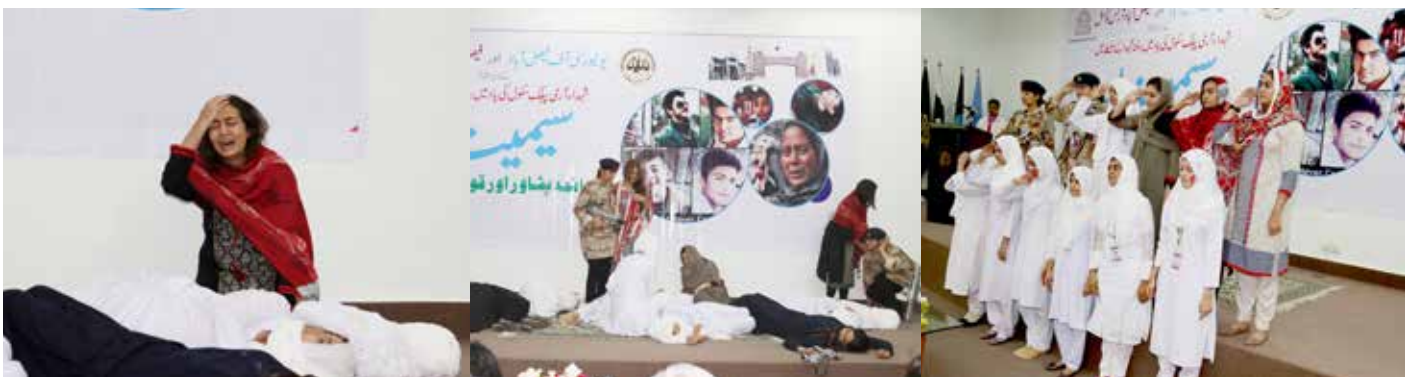
Student performing in tableau